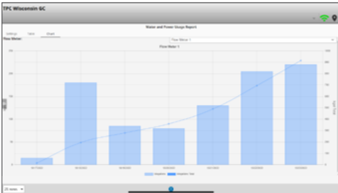
Build water usage reports.

Stay connected and in control of your systems with WaterVision 2.0 This next generation of advanced cloud telemetry adds 24/7 ease and convenience to your operation. Spend less time and money by eliminating site visits and view key information all in one spot.